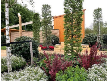
Belgian garden at Floriade 2022 Almere

In 2022 we exhibited typical flowers and plants from our country at the horticultural exhibition Floriade Expo 2022 in Almere (near Amsterdam). At the end of the Floriade, we also received the award for most sustainable participation with our regenerable (and entirely eatable!) garden and pavilion.