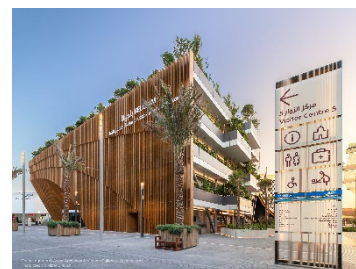
The Belgian pavilion at Expo 2020 Dubai

For a world expo BelExpo usually coordinates the construction of a full "Belgian pavilion". Last time, at Expo 2020 Dubai, we built a Belgian pavilion visited by millions of people interested in the architecture, in the exposition on Belgian mobility solutions or for an event on our roof terrace. The success achieved gave the whole team and everyone involved great satisfaction.